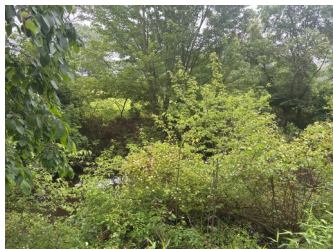
View of the Tax Ditch ROW from the Spring 2025 Tax Ditch Inspections

This portion of the Main Channel is south of White Oak Rd, across from Garrison Oak Technical Park. Public Works met on-site with Gene Vanderwende (KCD) in early 2025 to inspect this segment and discuss that it has never been dipped out before. Dipping out the Tax Ditch is necessary to remove silt build up and return the ditch to