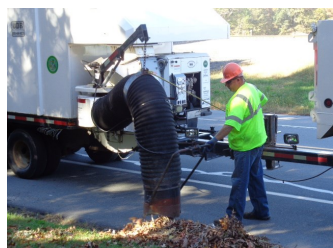
Members of the Public Works Stormwater Division operate the Leaf Vac and provide support with the Street Sweeper each Leaf Pickup Season

Fall Inspections of the White Oak Tax Ditch are slated to begin in late November 2025. However, in areas where Public Works Stormwater Division Support is needed, this may be delayed because of the City's Leaf Pickup Season, October 13, 2025 to January 16, 2026. The Stormwater Division