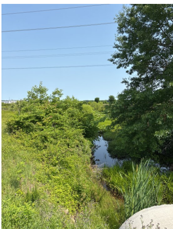
White Oak Tax Ditch at Garrison Oak

Two new briefings have been added to the Ditch Hub. The first briefing, "Living with the Tax Ditch" provides information to homeowners about the Tax Ditch in your backyard and what you can do to promote good Tax Ditch function. The second briefing, "White Oak Road Ditch Maintenance & Regrading" provides specific information related to the ditch maintenance and regrading project taking